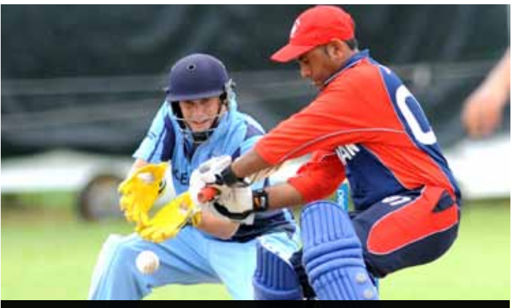
▲ Argentina and Bahrain in action during WCL Division 5 in 2012