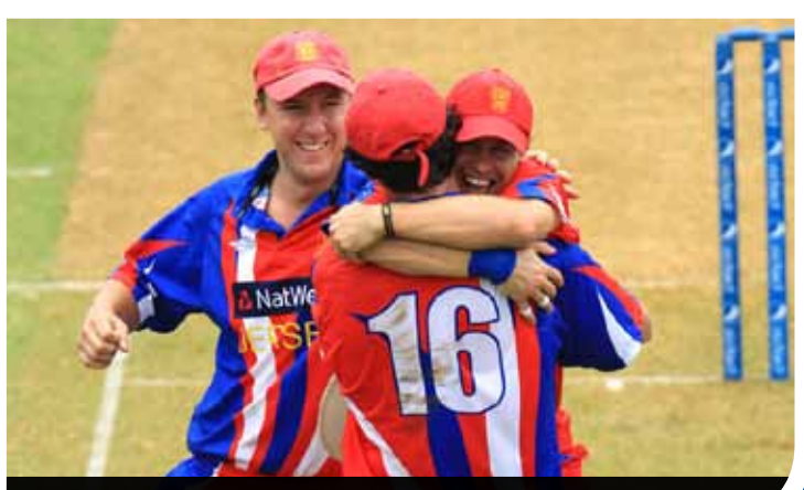
▲ Jersey returns to WCL Division 6 after finishing fourth in 2011