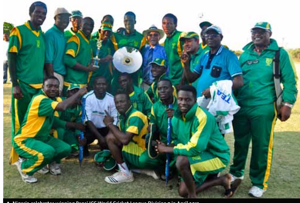
Nigeria celebrates winning Pepsi ICC World Cricket League Division 7 in April 2013

More information on the Pepsi ICC Development Programme and the WCL Structure can be found at www.icc-cricket.com